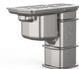
Retention Socket Adaptor Plate Required*